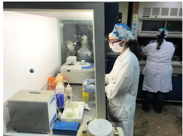
Venezuelan research team carrying out solid-phase peptide synthesis (SPPS), to produce COVID peptides.

The study also found the presence of mutations at sites may potentially be associated with increased infectivity. A more transmissible mutation of the virus may pose additional challenges for the control of the virus in Latin American countries. The report advised that public health authorities should carefully follow the progress of the pandemic and its impact on displaced populations within the region.