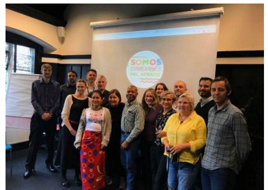
Researchers from the University of Glasgow, Diocese of Quibdó and SCIAF