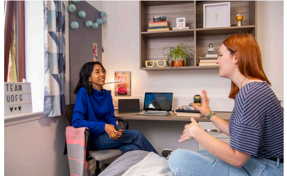
Accommodation Services offer a variety of residences and room types to choose from.