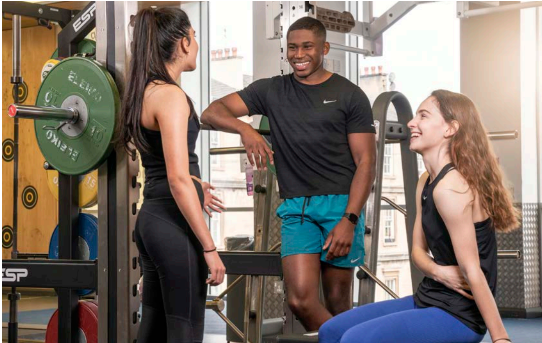
Over 50 sports clubs cater to all skill levels and abilities.