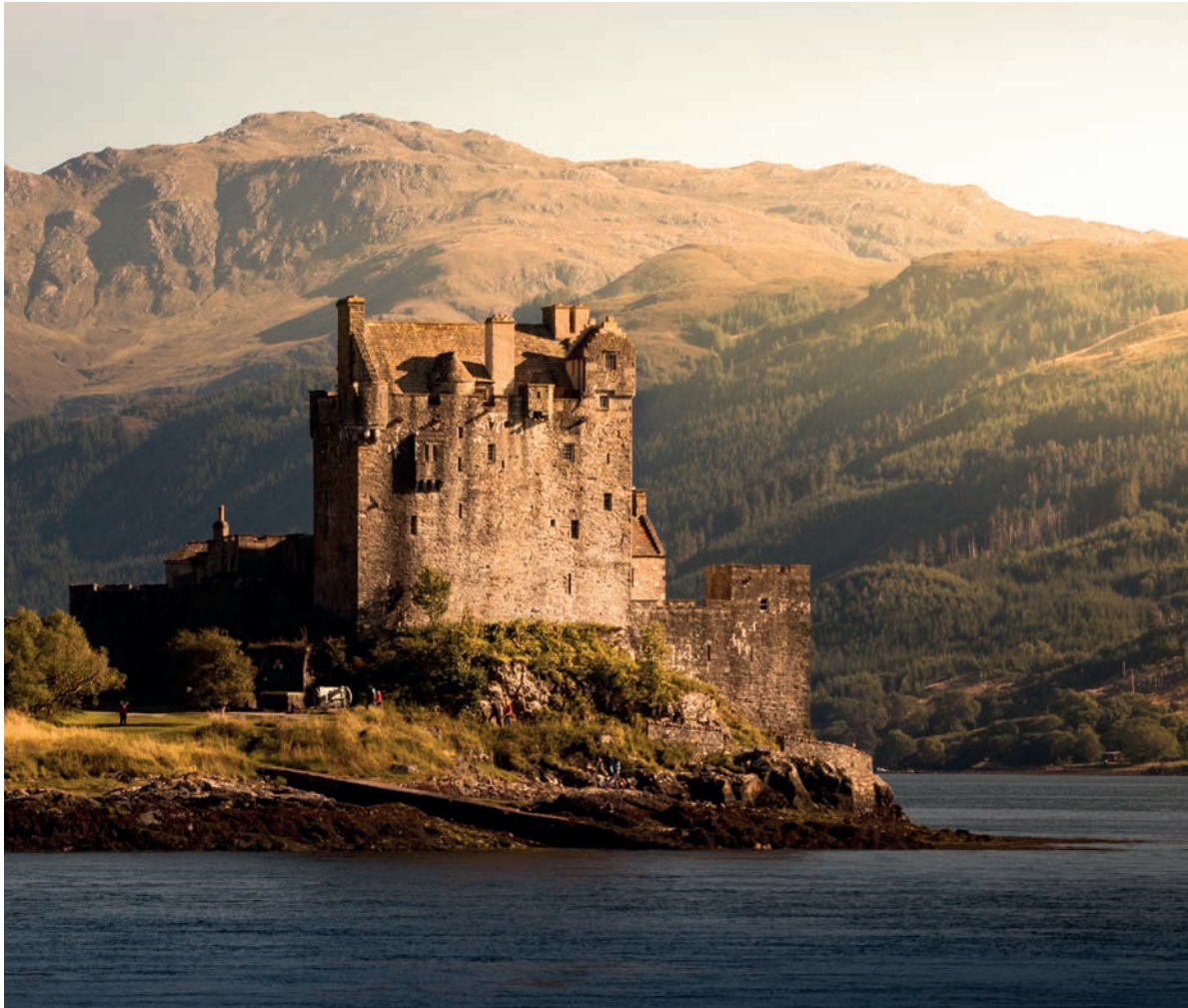
Eilean Donan Castle, Loch Duich.