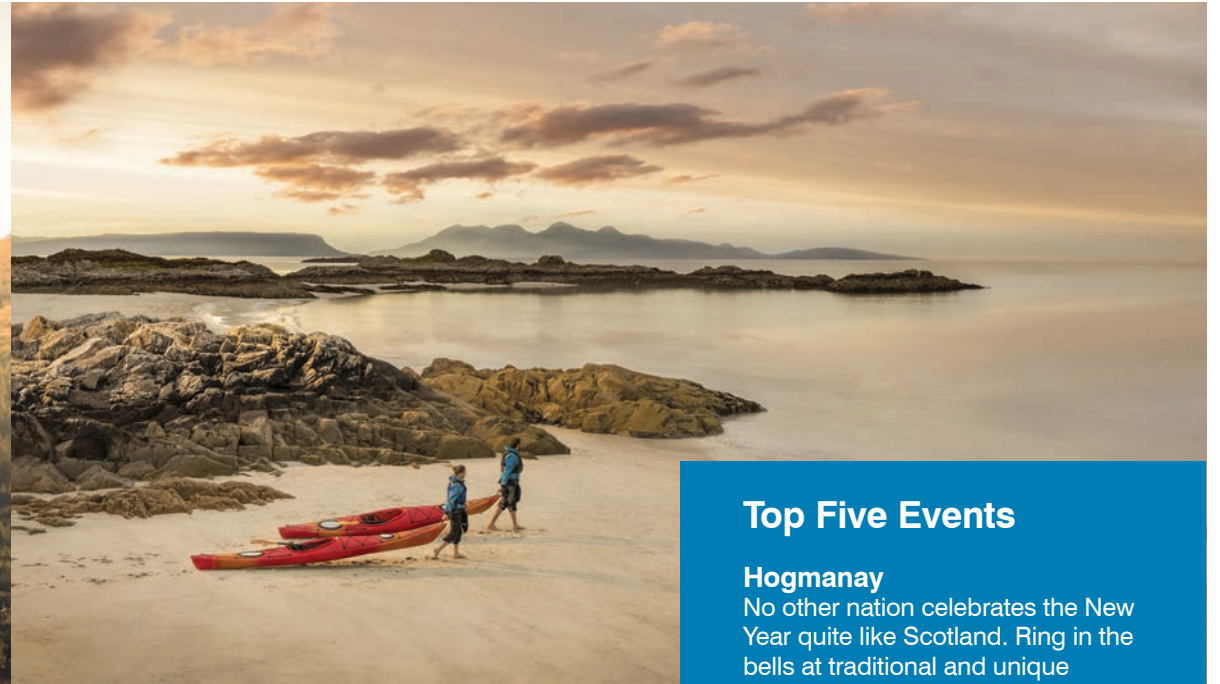
Camusdarach beach, Arisaig, Scottish Highlands.