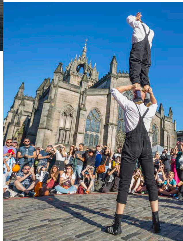
Performers, Edinburgh Fringe Festival.

Scotland has played a starring role on the big and small screen, as the filming location for top films and TV shows including Outlaw King , 1917 , Skyfall , Harry Potter and The Batman . In fact, the University itself is frequently used as a filming location and has featured in several episodes of Outlander . See visitscotland.com