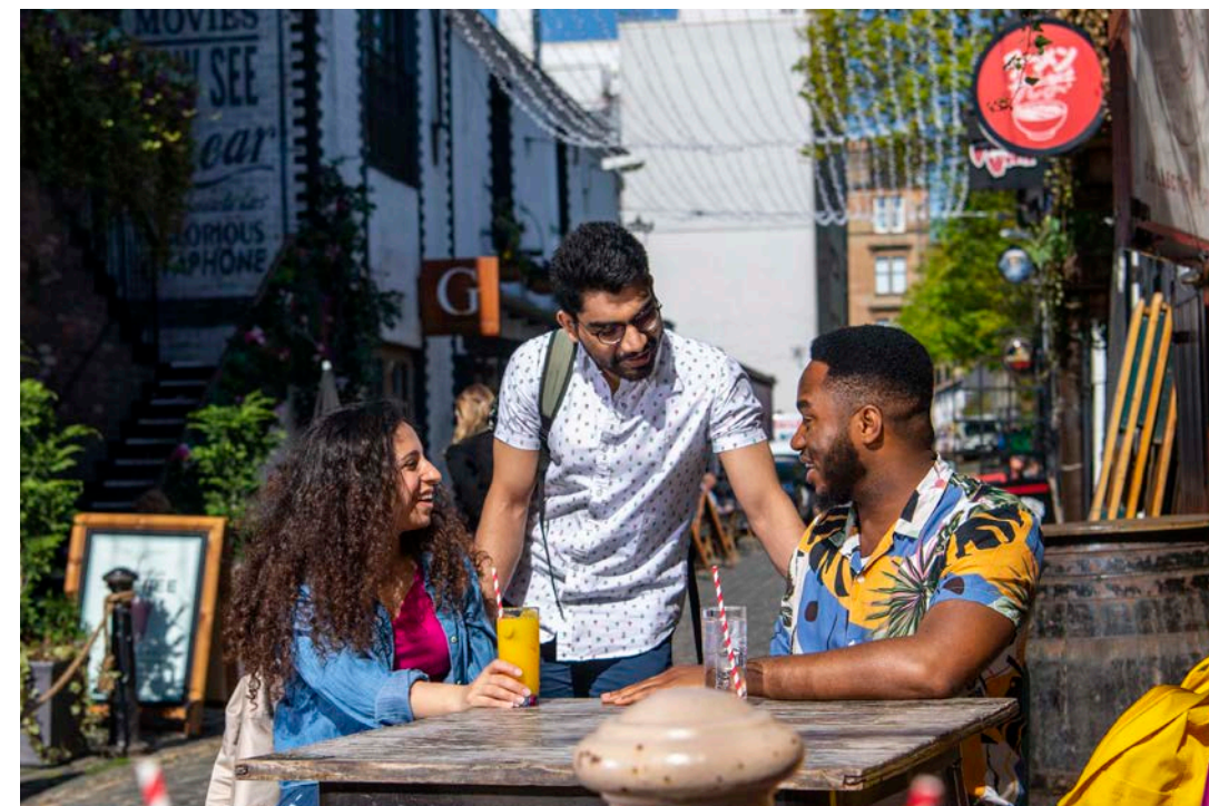
Ashton Lane, a lively cobbled lane next to the University which is packed with bars, restaurants and a cinema.