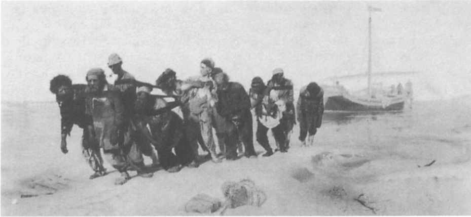
Figure 1. Il'ia Repin, Boathaulers on the Volga (1870–1873). Photo courtesy The Russian Museum.

rural population continued unabated. In this environment, it is not surprising that the dominant approach to the representation of peasants in the landscape, even in travel literature, remained that of P. Konchalovskii, whose 1897 guide to the rail line between Moscow and Iaroslavl' still found its admiration for Russian scenery in an appeal to populist themes. "The Russian landscape," he insisted, "helps foster the feelings of the people. Its contours strongly affect a person's moral essence; therefore the feeling of this open space . . . also forms a typical trait in our national consciousness and character." 55