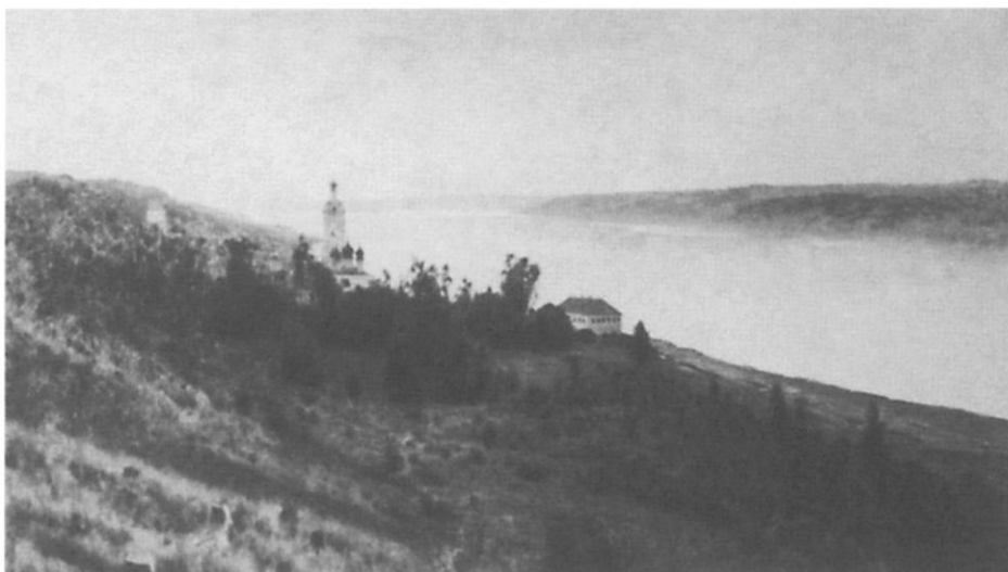
Figure 2. Isaak Levitan, Evening. Golden River (1889).

ennobled, rural environment his predecessors had conveyed so effectively. Beginning in the late 1880s, however, his confrontation with the Volga brightened his palette and ushered in the creation of a far more scenic imagery (figure 2). Whether or not Levitan was influenced by the new touristic approaches to the river, his light-filled, panoramic Volga landscapes of the late 1880s found him at a significant remove from the solemn populism of such landscape painters as his teacher Savrasov. His Volga paintings also laid the foundation for the almost sacred approach to national space he would develop in subsequent years in such works as Lake and Above Eternal Rest (figure 3).