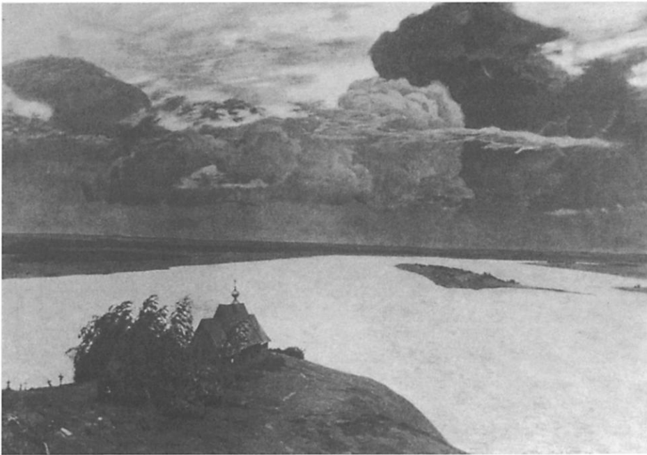
Figure 3. Isaak Levitan, Above Eternal Rest (1894).

tween the scenic postcard and the more familiar image of an unsophisticated, thus all-the-more-authentic, terrain (figure 5). 59