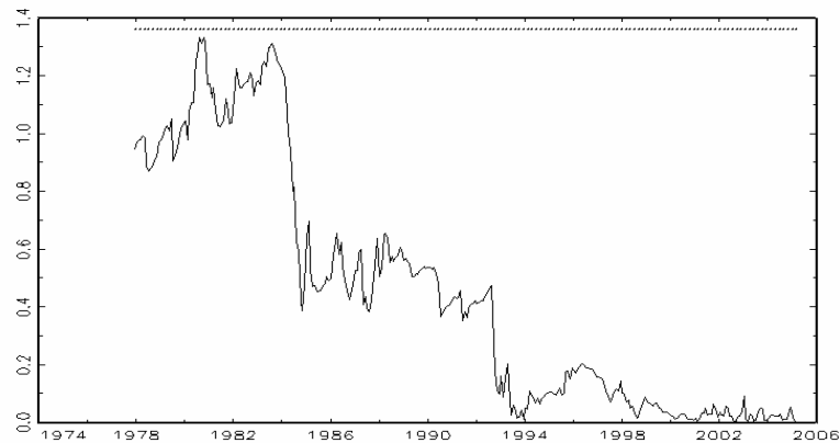
B. \tau -statistics