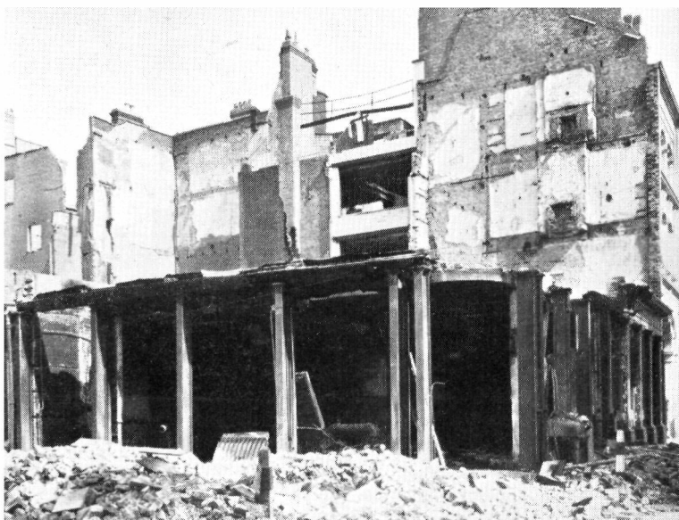
BREAD STREET, LONDON BRANCH, WHERE SECURITIES FROM THE CHANNEL ISLANDS AT FIRST WERE STORED, BEFORE AND AFTER DESTRUCTION IN MAY, 1941.