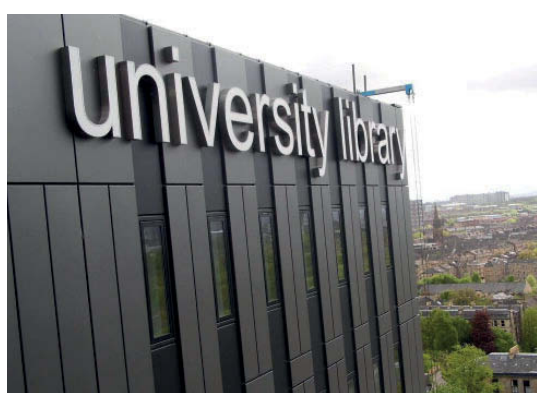
Above: Our most popular Facebook post in 2013

Library Blog: The Library Blog continues to post news on a wide variety of topics from the University Library, Special Collections and Archive Services. A popular post from 2013 was about the Darien Scheme and Special Collections display of original documents related to the Scheme. http://universityofglasgowlibrary.wordpress. com/2013/01/24/scotlands-failed-colony-thedarien-scheme/