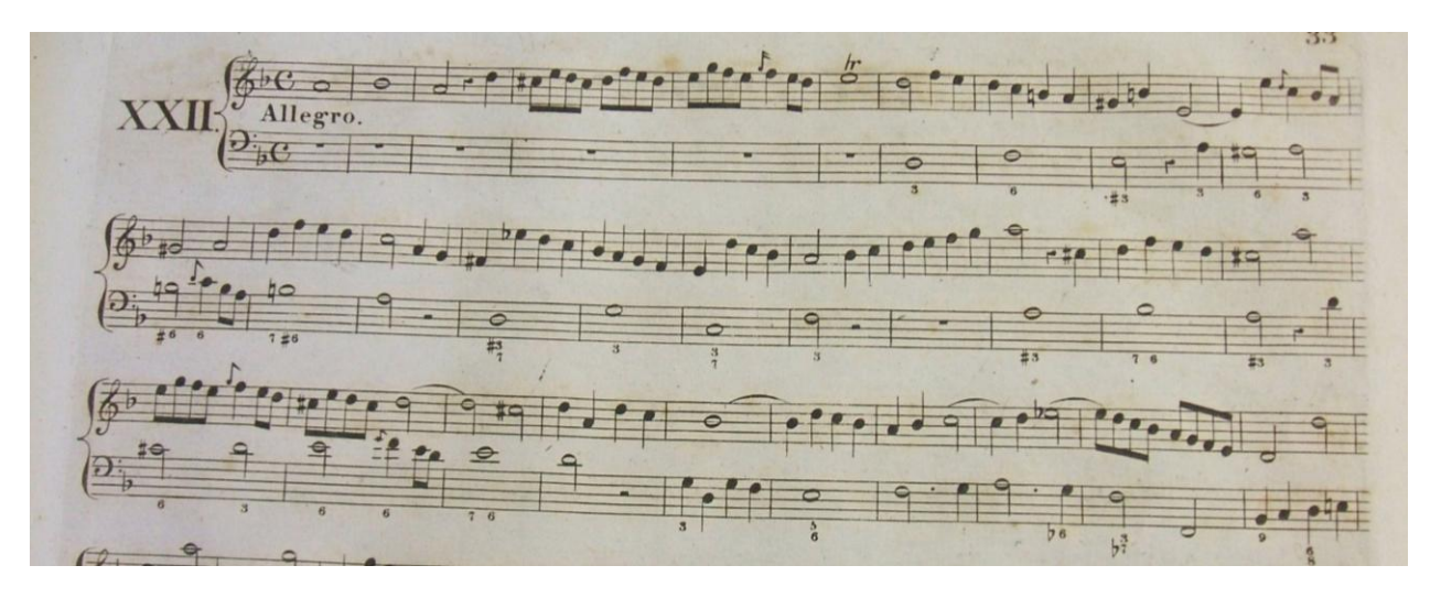
Giuseppe Aprile, The modern Italian method of singing, with a variety of... examples and thirty six solfeggi, 1805

This brings me to accompaniment. Now some of you may think that it is strange that I have no keyboard instrument with me today and instead I am accompanied here by Imogen Webb on the cello. Well, by this period the vast majority of songs would have been accompanied by the piano-forte, but there were still a few publications that write a figured bass accompaniment. Figured bass accompaniment is a bass line with numbers written underneath that indicates the notes in the chord. Usually the most common instruments playing this kind of accompaniment is a bass instrument such as the cello and a harpsichord.