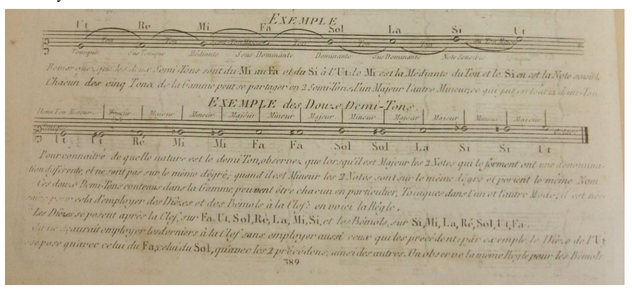
Leo, Durante, Scarlatti, et Al. A new edition of Solfèges d'Italie, 1820

The next area is that students of singing were encouraged to learn was how to perform the notes using sol-fa syllables. How many of you have seen The Sound of Music- so that song Do a deer a female deer is all about the sol-fa syllables Do, Re, Mi, Fa, So, La, Ti, Do. However, the sol-fa syllables in Italian, which most of these treatises refer to do not say Ti but instead say Si instead. Ti was not brought in until a much later period. The theory with these syllables is that they would help a singer learn how to sight-sing, that is reading the notes straight off the page without much help from instrumental accompaniment and it was also thought the syllables would better a singer's tuning. By the later treatises, from about 1840 onwards, what is interesting is that discussion of the sol-fa syllables does not frequently appear and in fact one of the later works written in 1860 by Rimbault he says that the Latin syllables or the sol-fa syllables are "sometimes" applied to the note names. (Rimbault, 1860, pp. 13) His use of "sometimes" demonstrates that these syllables had fallen out of fashion, though they were still occasionally used by some teachers of singing.